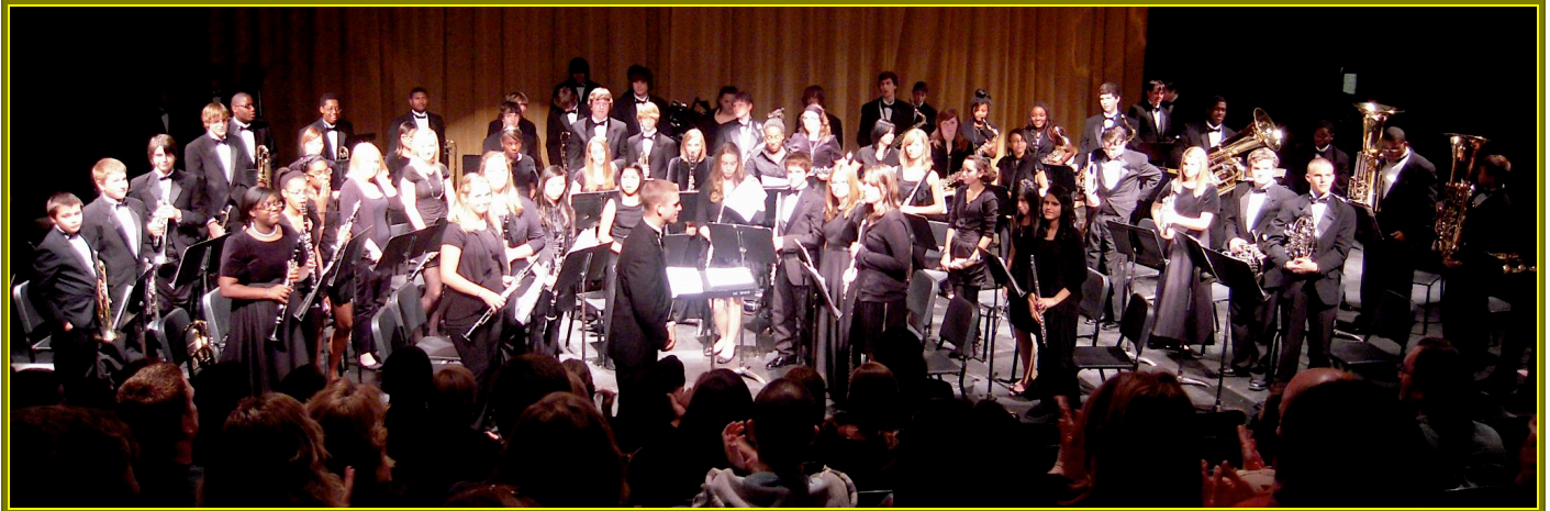
HC Concert Band at the Fall Concert

The HC Band concert season is off to a busy start! See photos below of the HCWE/HCCB Fall Concert and the HC Jazz/Percussion Concert . Make plans to attend the HCWE/HCCB Holiday Concert next Tuesday, December 14, at 7 p.m. in the HC Lassiter Theatre.