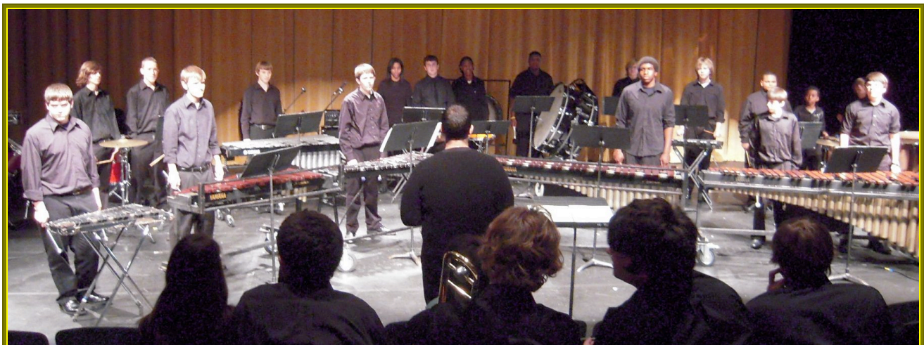
HC First-Hour Percussion Ensemble at the Jazz/Percussion Concert