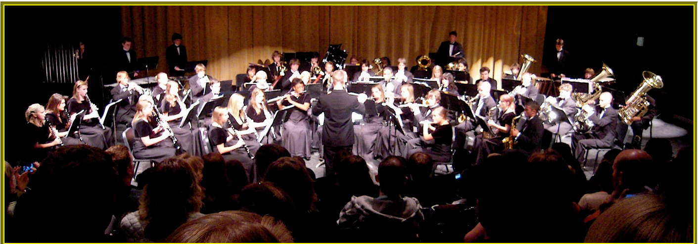
HC Wind Ensemble at the Fall Concert